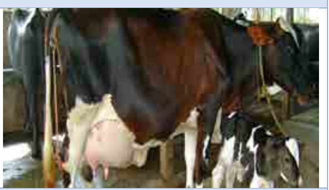
Faculty of Dairy Technology