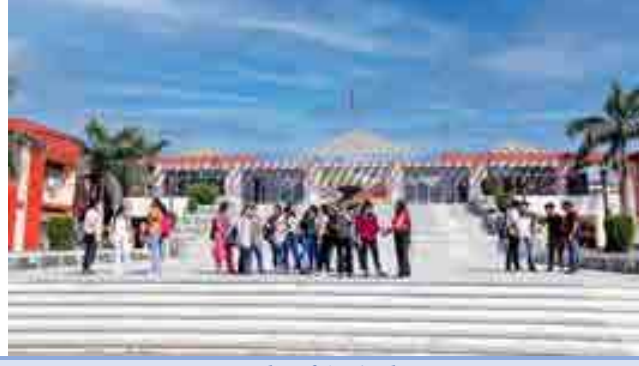
Faculty of Agriculture

University has extensive infrastructure within its jurisdiction and command. The main campus at Chatha is spread over 578 acres, where Faculty of Agriculture, Faculty of Basic Sciences, Faculty of Agricultural Engineering, Faculty of Horticulture & Forestry and Institute of Biotechnology are located. Faculty of Veterinary Sciences & Animal Husbandry and Faculty of Dairy Technology at R.S. Pura have an extent of 84 acre campuses. The total land possession with the University (including Research Stations / Sub-Stations and KVKs) is 1139.12 acres. There are 09 Research Station and Sub Stations, and