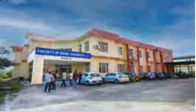
Faculty of Basic Science

The University has highly structured infrastructure facilities in terms of buildings, laboratories, lecture rooms, instructional and research farms, modern instruments equipments, farm machinery, transport and library facilities. It has distinguished and qualified faculty positioned at all the campuses and regional research stations. The faculty members and the postgraduate students of the University have won numerous national and international recognitions in the forms of awards, honours and fellowships awarded by the prestigious professional scientific bodies / societies.