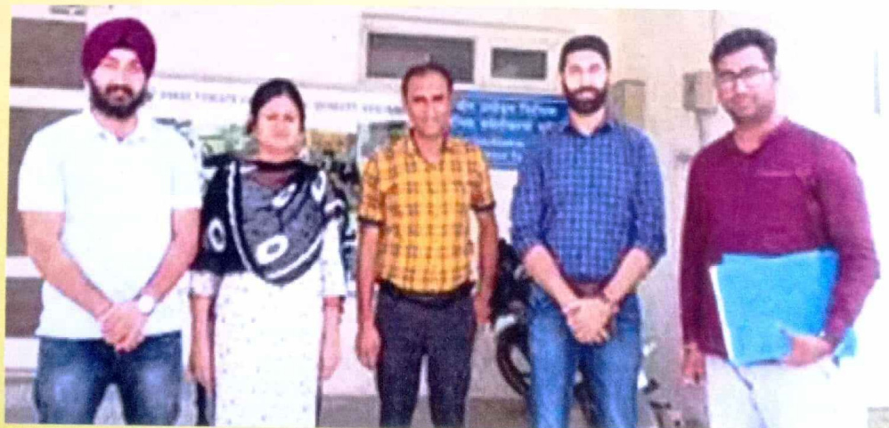
Visited Central University of Jammu for the wider publicity of the programmes