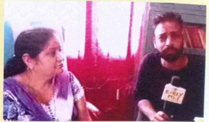
Live interview with Channel One and Early Post News Channels