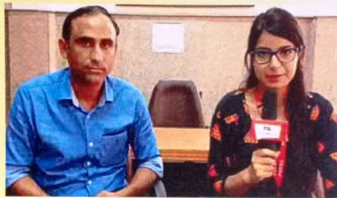
Live interview with The Straight Line News Channel in Regional Language