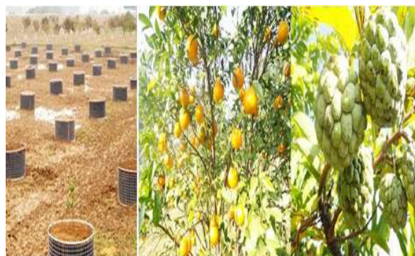
Faculty of Horticulture & Forestry