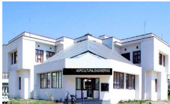
Faculty of Agricultural Engineering

The University has highly structured infrastructure facilities in terms of buildings, laboratories, lecture rooms, instructional and research farms, modern instruments/equipments, farm machinery, transport and library facilities. It has distinguished and qualified faculty positioned at all the campuses and regional research stations. The faculty members and the post-graduate students of the University have won numerous national and international recognitions in the forms of awards, honours and fellowships awarded by the prestigious professional scientific bodies/societies.