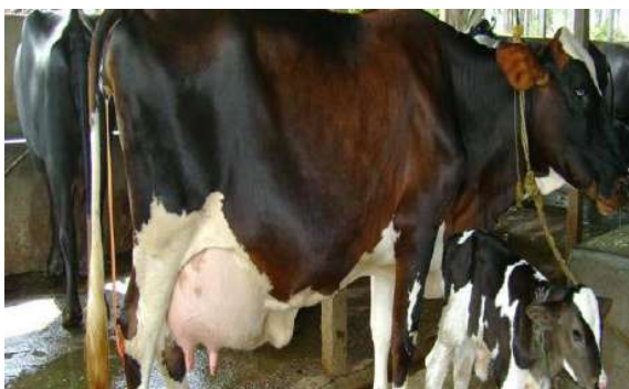
Faculty of Dairy Technology