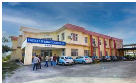
Faculty of Basic Sciences