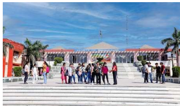
Faculty of Agriculture

The University has extensive infrastructure within its jurisdiction and command. The main campus at Chatha is spread over 578 acres. The Faculty of Agriculture, Faculty of Basic Sciences, Faculty of Agricultural Engineering and Faculty of Horticulture & Forestry and a School of Biotechnology are located in it. Faculty of Veterinary Sciences & Animal Husbandry and Faculty of Dairy Technology at R.S.Pura has an extent of 84 acres. The total land possession with the University (including Research Stations/Sub-Stations and KVKs) is 1139.12 acres. There are 09 Research Station and Sub Stations. and nine KVKs in the University that are located in different agro-climatic zones of Jammu region for catering to location-specific needs of the farming community. University pursues high standard of location specific and problem-solving research through research projects funded by various central, state agencies & other funding agencies. At the faculty level the emphasis is on imparting of quality education by providing congenial atmosphere in the campus. The inception of high-tech infrastructure involving computer-based facilities, internet connectivity and modern administrative dispensation are vital characteristics of this University.