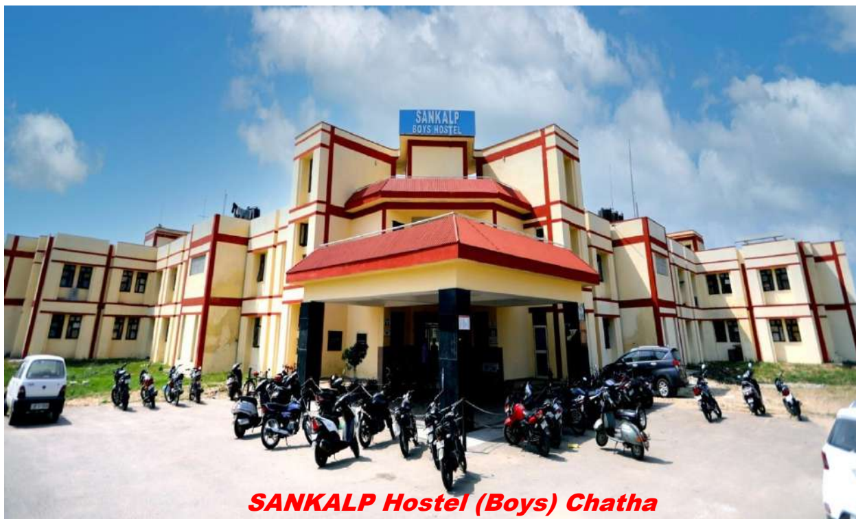
SANKALP Hostel (Boys) Chatha