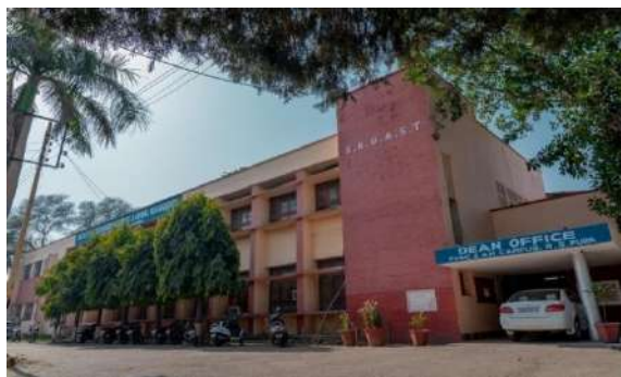
Faculty of Veterinary Sciences & Animal Husbandry Agricultural