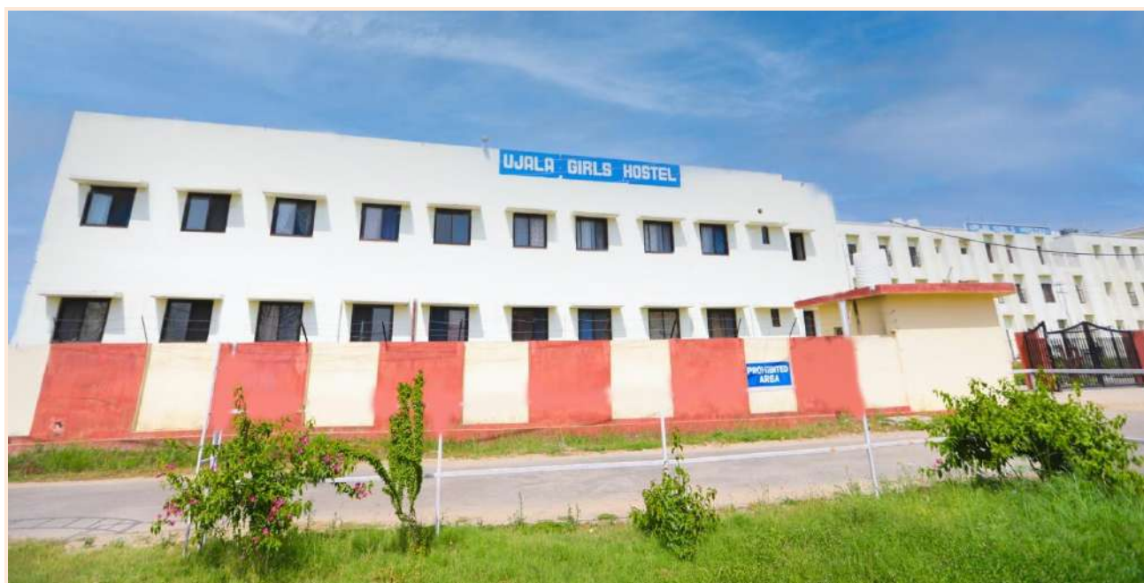
UJALA Girls Hostel