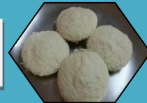
Proso Millet Idli