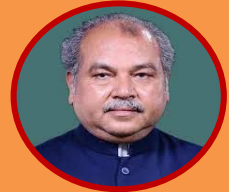
Shri Narendra Singh Tomar Hon’ble Union Minister of Agriculture and Farmers Welfare