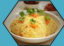
Foxtail Millet Rava Idli