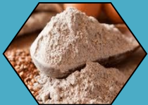
Multi Grain Millet Atta