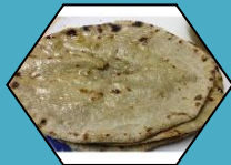
Bajra Ki Roti