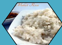
Little Millet Rice