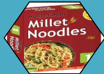
Multi Grain Millet Noodles

Millets are a highly varied group of small-seeded grasses, widely grown around the world as nutriceals for human food