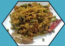
Bajra Ki Khichdi

Mahavir Jayanti ( Jammu Distt. only ) 4 th April Good Friday ( Jammu Distt. only ) 7 th April Baisakhi 14 th April Birthday of Dr. B.R. Ambedkar 14 th April *Shab-i-Qadr 18 th April Jumat-ul-Vida 21 st April *Eid-ul-Fitar 22 nd April Parshuram Jayanti 22 nd April (Jammu Province only, Restricted Holiday)