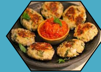
Foxtail Millet Patties