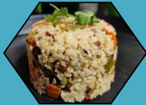
Proso Millet Upma