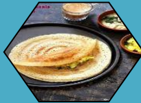
Proso Millet Masala Dosa