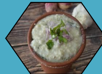
Little Millet Porridge