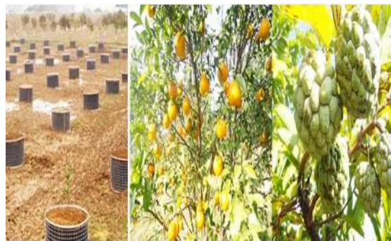
Faculty of Horticulture & Forestry