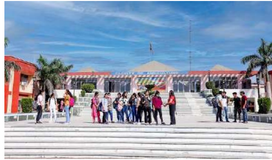
Faculty of Agriculture

The University has extensive infrastructure within its jurisdiction and command. The main campus at Chatha is spread over 578 acres. The Faculty of Agriculture, Faculty of Basic Sciences, Faculty of Agricultural Engineering and Faculty of Horticulture & Forestry and a School of Biotechnology are located in it. Faculty of Veterinary Sciences & Animal Husbandry and Faculty of Dairy Technology at R.S.Pura has an extent of 84 acres. The total land possession with the University (including Research Stations/Sub-Stations and KVKs) is 1139.12 acres. There are 14 Research Station and Sub Stations. and nine KVKs in the University that are located in different agro-climatic zones of Jammu region for catering to location-specific needs of the farming community. University pursues high standard of location specific and problem-solving research through research projects funded by various central, state agencies & other funding agencies. At the faculty level the emphasis is on imparting of quality education by providing congenial atmosphere in the campus. The inception of high-tech infrastructure involving computer-based facilities, internet connectivity and modern administrative dispensation are vital characteristics of