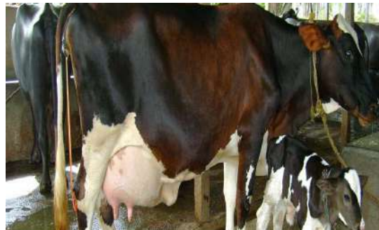
Faculty of Dairy Technology