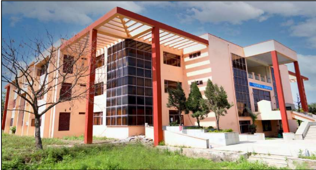
Central Library, Chatha