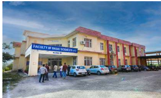
Faculty of Basic Sciences