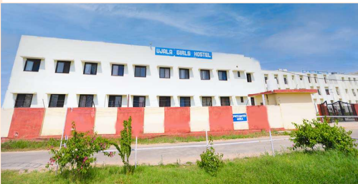
UJALA Girls Hostel