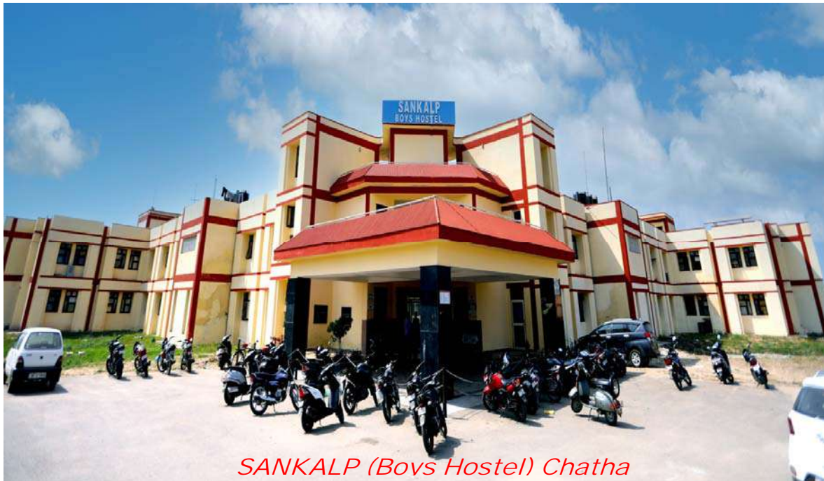
SANKALP (Boys Hostel) Chatha