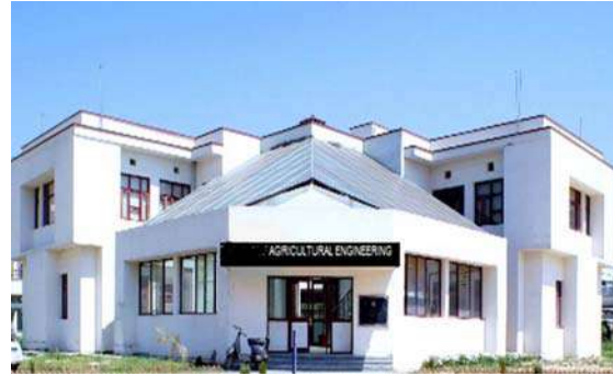
Faculty of Agricultural Engineering

The University has highly structured infrastructure facilities in terms of buildings, laboratories, lecture rooms, instructional and research farms, modern instruments/equipments, farm machinery, transport and library facilities. It has distinguished and qualified faculty positioned at all the campuses and regional research stations. The faculty members and the post-graduate students of the University have won numerous national and international recognitions in the forms of awards, honours and fellowships awarded by the prestigious professional scientific bodies/societies.