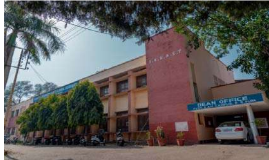
Faculty of Veterinary Sciences & Animal Husbandry Agricultural