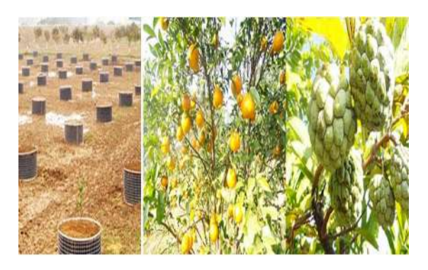
Faculty of Horticulture & Forestry