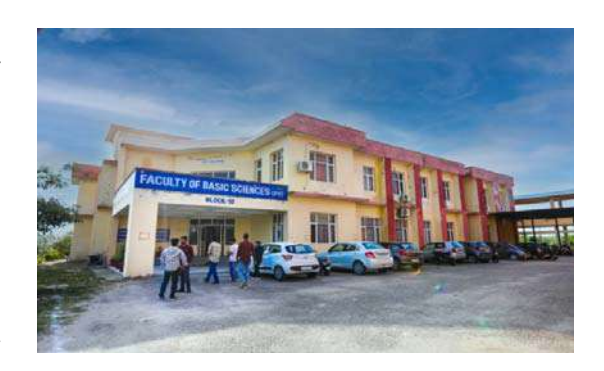
Faculty of Basic Sciences