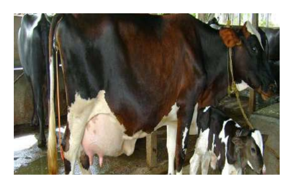
Faculty of Dairy Technology